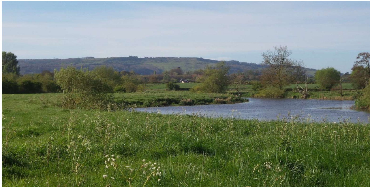
01. The Avon floodplain at Lower Moor looking across to Haines Meadows, with Bredon Hill in the background 18.04.2017.