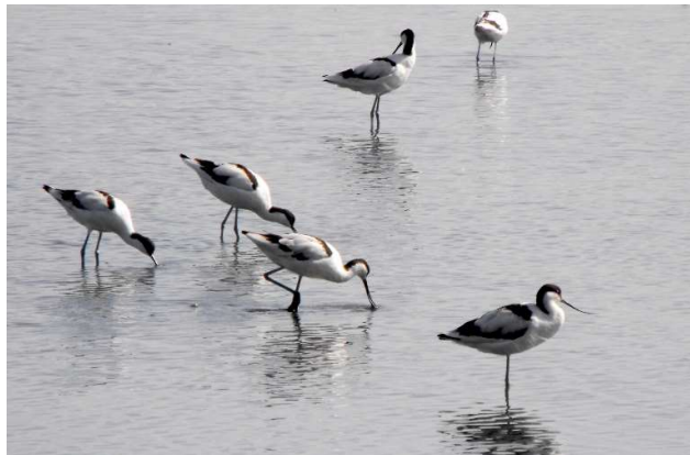
09. Avocets Recurvirostra avosetta first appeared at Lower Moor in 1996 and have become regular visitors in recent years. Gary Farmer.

Snipe Gallinago gallinago bred in the area in the past but the last drumming and presumed breeding birds were heard around the meadows in 1987. This species is now a winter visitor and a spring and autumn passage migrant. Up until the early 1980s, counts of 1,000+ were not unusual around the river meadows during the winter months. Around 100 Snipe were regularly seen in November and December up until c2012 but these numbers continue to fall. The most recent big counts were on 17th August 2013 after the flash had been kept wet throughout the summer period for the first time and 42 birds were feeding in the muddy surrounds. Then a good count for recent times was 65 in a nine-acre pasture at Lower Moor on 13 th September 2013.