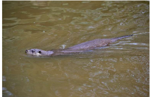
05. Otters Lutra lutra are being seen more frequently, often in daylight.

As with all of our wildlife nationally, we have seen changes in populations and distribution of mammals over the last few decades and the fortunes of species in the Vale reflect that. Foxes Vulpes vulpes and Badgers Meles meles are still common in the area and are regular night-time visitors to the meadows. The regularity of Mink Neovision vison sightings has dropped but they are still seen throughout the year, whereas Otters Lutra lutra are being seen more frequently, often in daylight (05). Their spraints have been found on several occasions and at one favoured sprainting spot, amongst the many fish scales the remains of Signal Crayfish Pacifastacus leniusculus have been found.