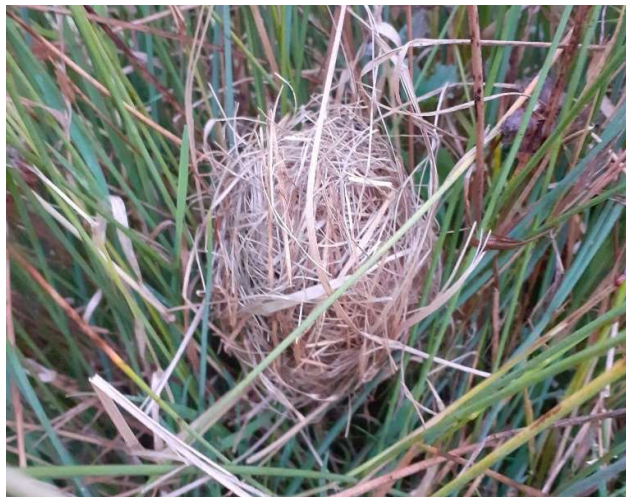
07. Harvest Mouse Micromys minutus nests have been found in recent years including at Lower Moor 14.09.22. Rob Prudden.

The once common Water Vole Arvicola amphibius has followed national declines and has not been seen on my patch for many years, but Field Vole Microtus agrestis is still common in most areas and is an important prey item; remains of this species have been found in every Barn Owl Tyto alba pellet dissected from local owl boxes. Bank Vole Myodes glareolus remains have also been found in Barn Owl pellets, but the live animals are rarely seen. Grey Squirrel Sciurus carolinensis is no longer confined to wooded areas and has become a very common resident in any habitat, and we regularly have to evict them from owl boxes in the winter. Brown Hare Lepus europaeus was once common and seen all around the area but