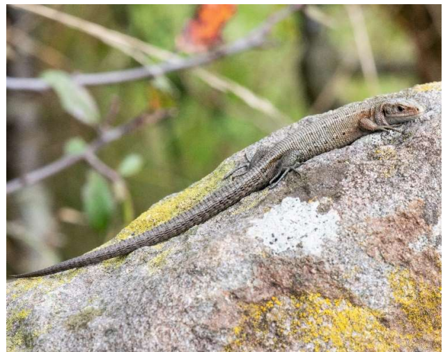
08. Common Lizard Zootoca vivipara has only been noted on three occasions but may well be overlooked. Gary Farmer

Over the years many people have claimed to have seen Adders Vipera berus , but no sightings have ever been verified. Some of the sightings have typically turned out to be dark & well marked Grass Snakes Natrix helvetica which remains a fairly common species, often seen swimming in the river or other nearby water courses. Common Lizards Zootoca vivipara (08) have only been noted on three occasions but may well be overlooked. Recent residential developments on sandy ground will have removed habitat and they would without doubt have been much more numerous in the past. The most recent record was from a garden wall in Bridge Street near the railway line on 23 rd April 2016. Slow-worm Anguis fragilis was once a common reptile here, especially on the warm, sandy ground but is now scarce due to loss of habitat.