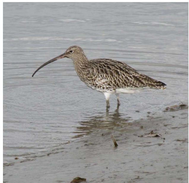
03. Changes from summer hay-cutting to earlier silage-cutting contributed to the loss of Curlew as a breeding species in the area. Gary Farmer.

Today around fifty acres of grassland at Lower Moor and nearly 60 acres directly opposite at Haines Meadows, Wick, are owned and managed by Vale Landscape Heritage Trust (VLHT) who have been working to bring back more traditional grassland management to the area. Several meadows are cut for hay late in the summer, with aftermath grazing by cattle and/or sheep when practicable. The remaining areas are managed by cattle grazing alone. There are low areas, managed as wader scrapes on both sides of the river. At Haines Meadows, investigations are ongoing in view of installing a wind-powered water-pump to better manage the water levels on the scrape there.