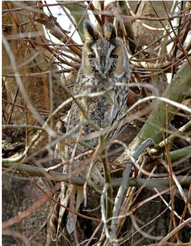
13. Long-eared Owl at Haines Meadows 02.03.17. Andy Warr.

Long-eared Owl Asio otus is an even rarer visitor to the river meadows, with just two records to date. In 2017 a single bird roosted in a large willow pollard (11) alongside the river at Wick opposite Osier Island. First noted on 1st February, it was present in the same tree daily before leaving overnight on 13 th /14 th March. The following year on 9 th November 2018 amazingly one roosted in a Holly tree in a small rear garden on Bridge Street in Lower Moor village. First seen at mid-day it was alert, being very aware of passing trains, wind gusts and even a gardener working just over the fence only fifteen feet away! The bird was still present at last light but not seen the following day.