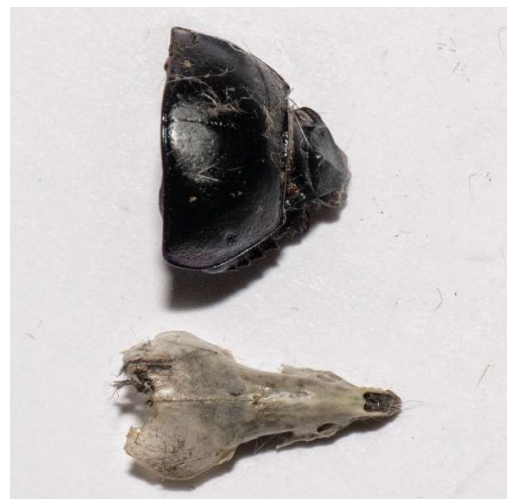
12. The remains of Geotrupes spiniger and Pygmy Shrew skull from a dissected Barn Owl pellet. 11.01.21, Haines Meadows.