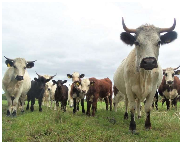
02. Cattle grazing helps to keep a diverse sward and reduces scrub encroachment. Haines Meadows 04.10.22.