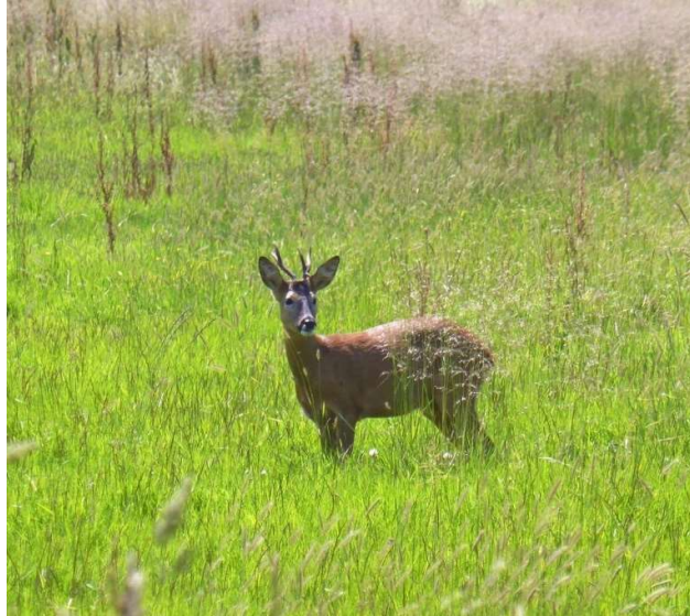
06. Roe Deer Capreolus capreolus is resident along both sides of the river and numbers appear to be increasing. Lower Moor 21.06.22. Gary Farmer

nearby human habitation. The House Mouse Mus musculus is also found around nearby human habitation and remains have been identified from owl pellets. Wood Mouse Apodemus sylvaticus is a fairly common resident, whereas Harvest Mouse Micromys minutus appears to be scarce, but nests have been found on a few occasions in recent years including the 24 th September 2014 when a fresh nest was found in a patch of Reed Canary Grass Phalaris arundinacea alongside the car park at Lower Moor. Then on 21 st November 2021 whilst mowing paths into a two-acre plot that has been allowed to revert to scrub at Haines Meadows, at least five nests were located. On 14 th September 2022 cattle grazing exposed a nest in a patch of rushes Juncus at Lower Moor (07).