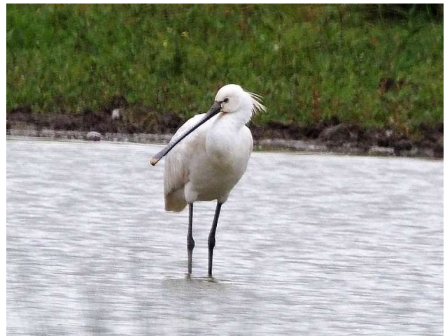
10. Spoonbill was a new species for the area when this one dropped in at Lower Moor 01.09.21. Tom & Sally Hutchinson.

There is only one brief record of Spoonbill Platalea leucorodia (10) from the area; an adult was present at the river flash at c15.30 on 1 st September 2021 (T. & S. Hutchinson pers. comm.) but had gone by the time I arrived there at c16.00. Evidently an adult had left Middleton Lakes in the Tame Valley earlier in the day then it was seen at Slimbridge on 5th. Three species of egrets have recently been recorded in the area, with the first being the only record so far of Cattle Egret Bubulcus ibis when two full summer plumaged birds were seen perched on a small tangle of scrub near the centre of the large lake at the gravel pits on 24 th June 2017 (Bob Heson pers. comm.). The next species to be found was a Great White Egret Ardea alba at the river flash each afternoon between 14 th and 18 th